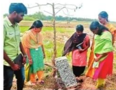
கள்ளிக்குடி அடுத்த மருதக்குடியில் கண்டெடுக்கப்பட்ட நாயக்கர் கால கல்வெட்டு.